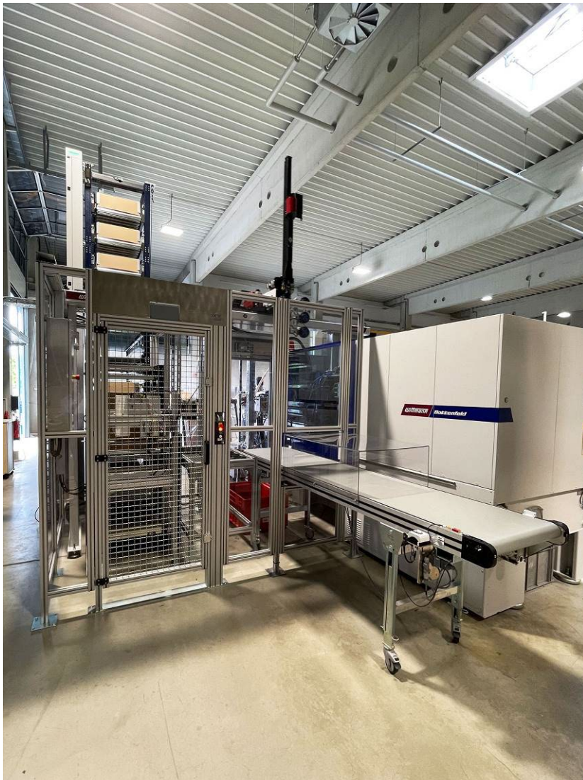
Fig. 3: Complete system – rear view