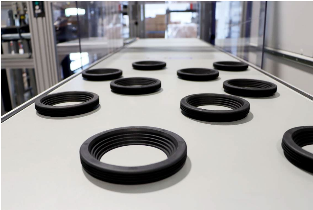
Fig. 5: Seals for wall-mounted cisterns