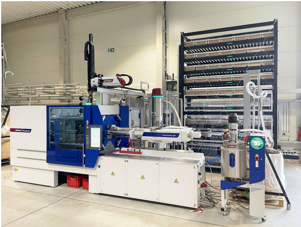
Fig. 2: SmartPower 240/1330 with WITTMANN automation