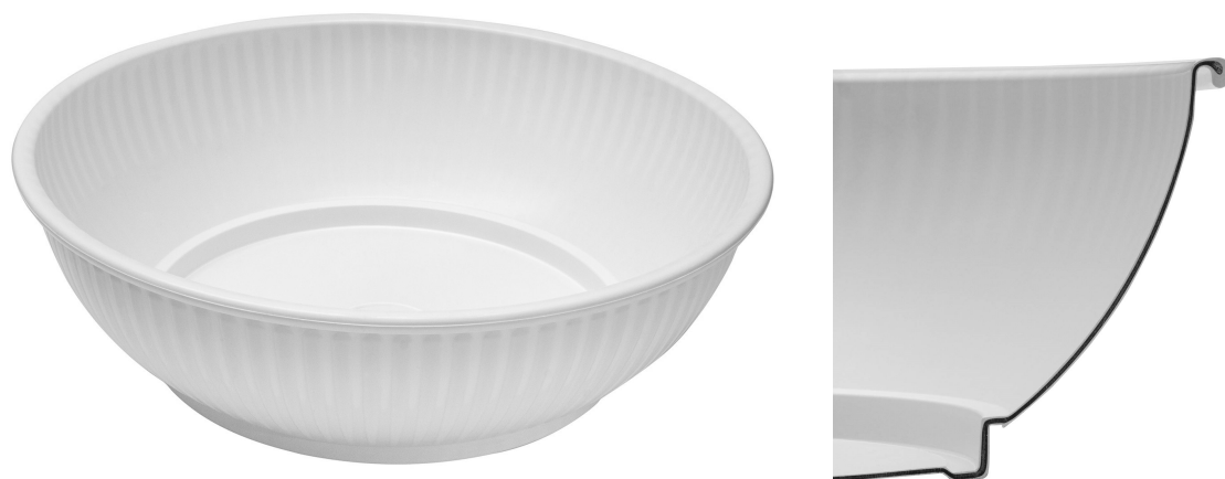
Fig. 1a+b: Application example “large bowl” and 3-layer shell-core-shell structure