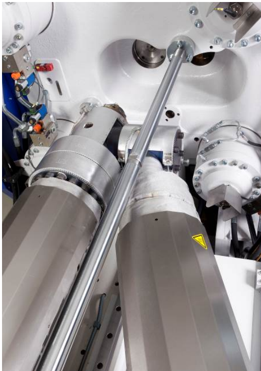
Fig. 4: Y configuration of injection units