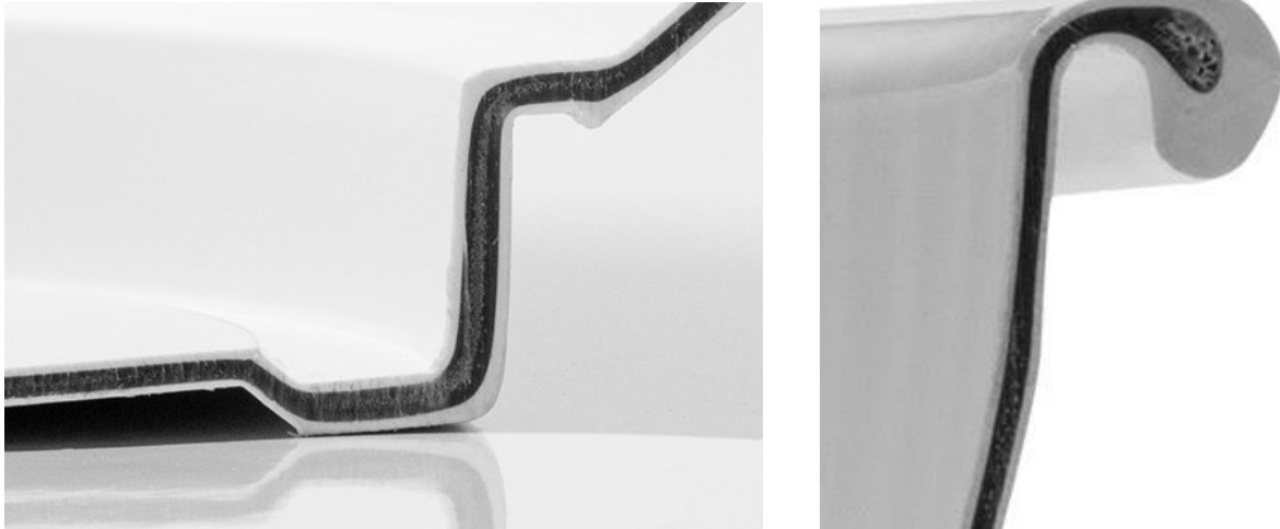
Fig. 2: 3-layer core material foamed to prevent sink marks