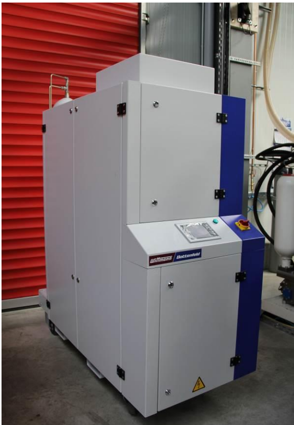
Fig. 3: Pressure generator from WITTMANN BATTENFELD for the AIRMOULD ® gas injection process and the CELLMOULD ® structured foam process