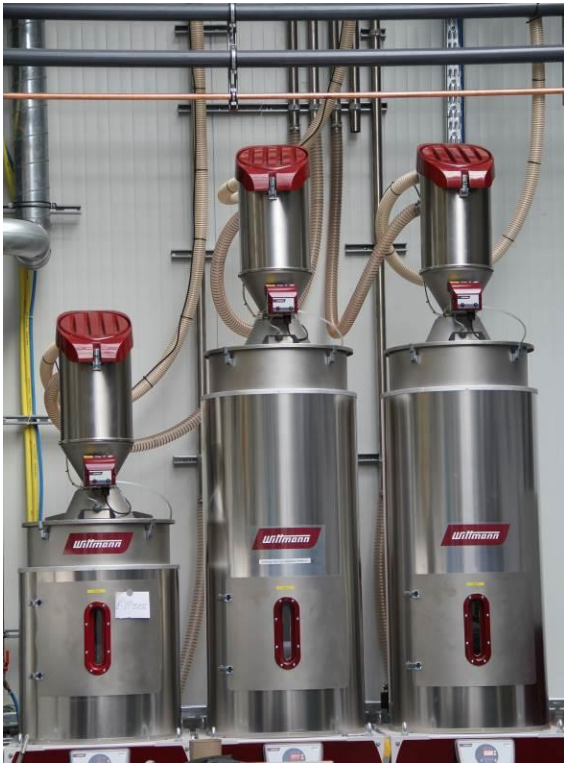
Fig. 4: WITTMANN conveyance system