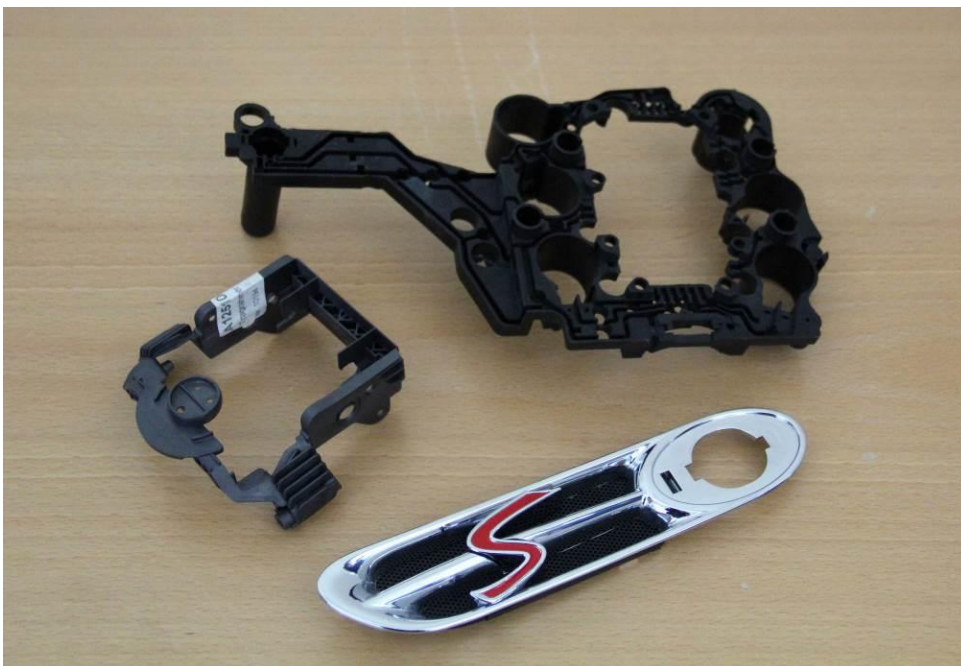
Fig. 7: Various parts for the automobile industry