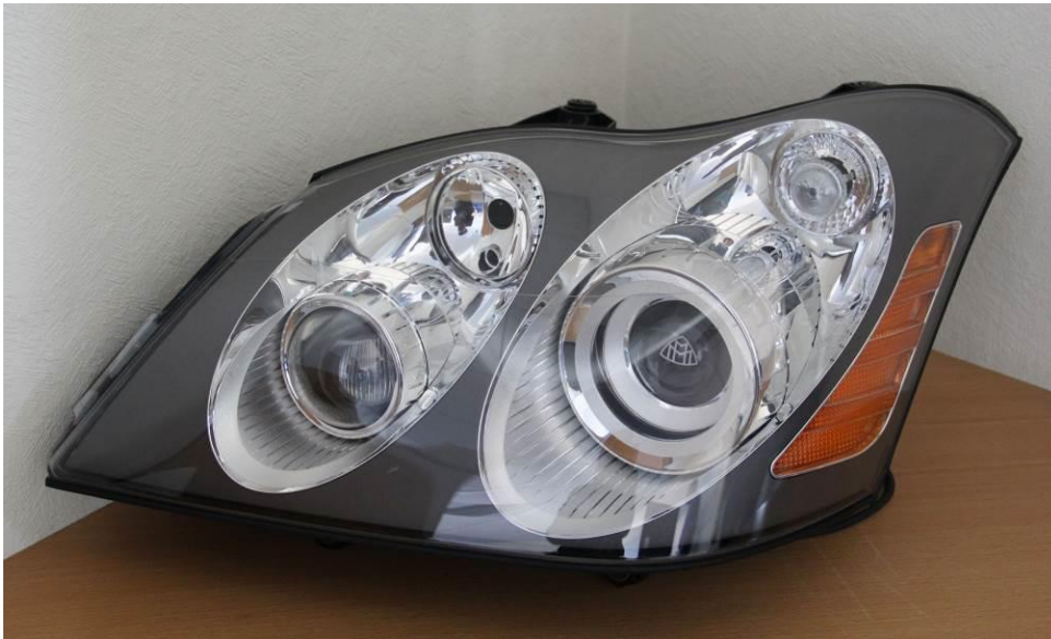
Fig. 6: Headlights