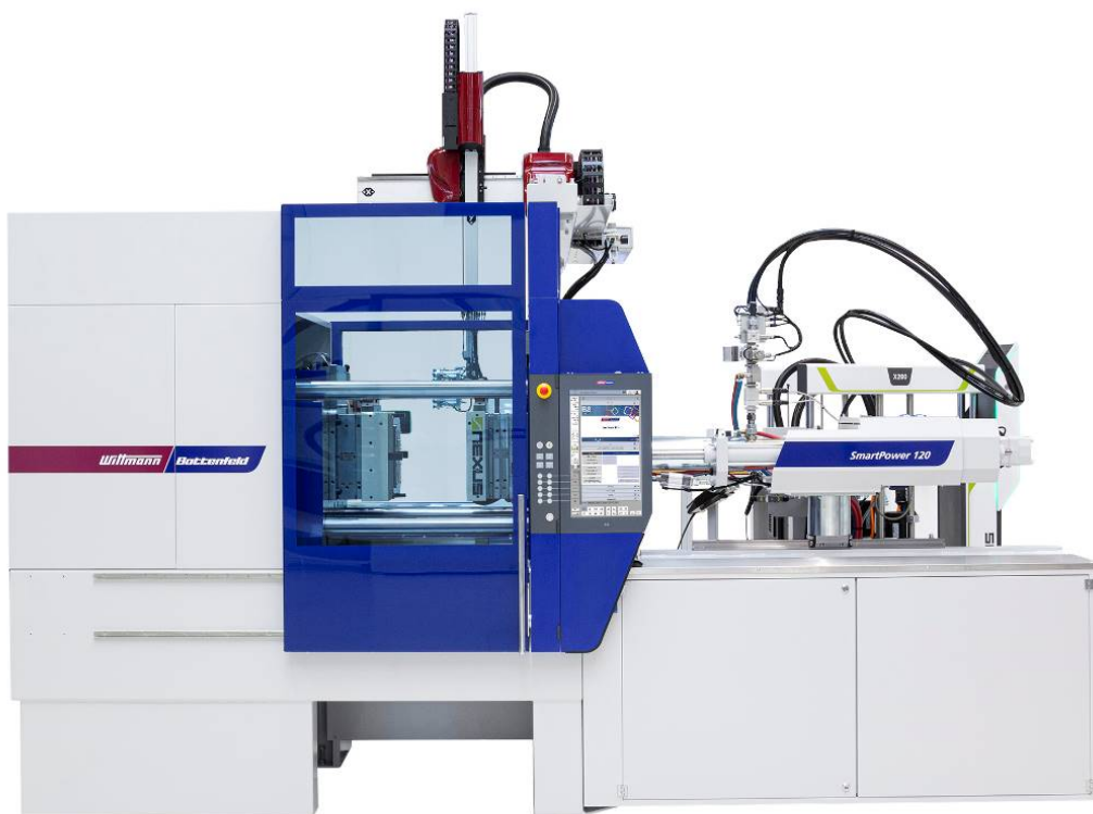
Fig. 1: SmartPower 120/350 LSR

When a drinking glass is placed on the “Drinky”, a pre-programmed timer is activated, which reminds us every 10 minutes that we should consume enough liquid. The reminder comes in the form of a flashing light signal.