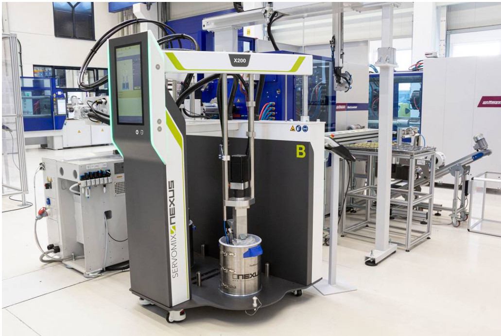
Fig. 4: SmartPower 120/350 LSR – Servomix X200 dosing unit