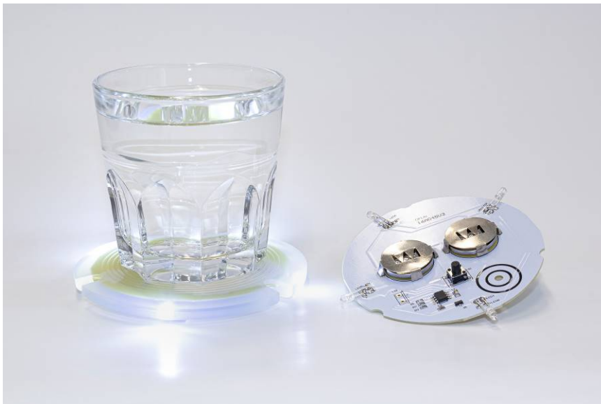
Fig. 5 from left to right: finished "Drinky" drink manager, PCB fitted with battery cells