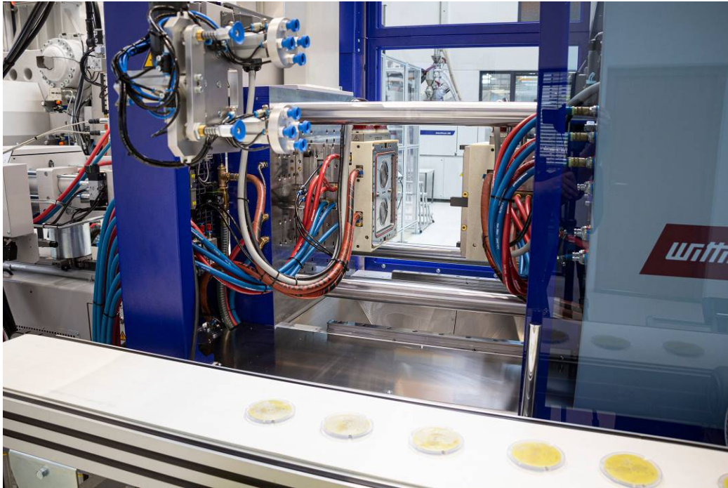
Fig. 2: SmartPower 120/350 LSR – 2-cavity mold for insertion of printed circuit boards