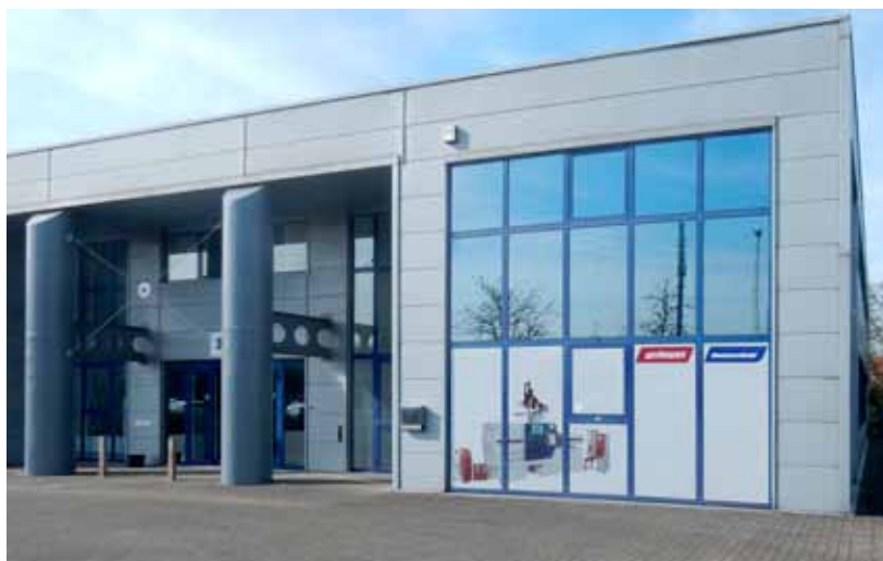
View of WITTMANN BATTENFELD Benelux NV premises in Holsbeek, Belgium.