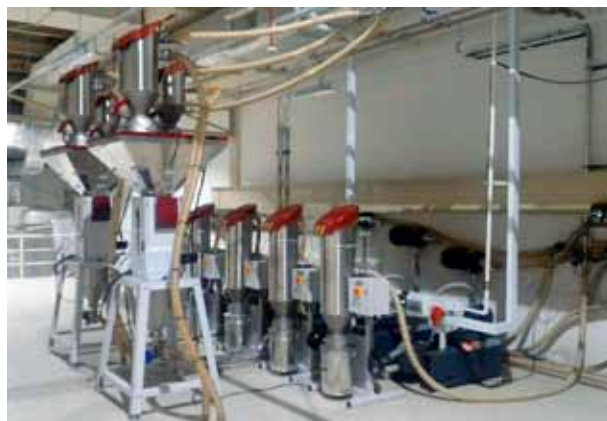
GRAVIMAX blenders on pedestals, right behind filter stations and vacuum pumps.

WIK Plant Manager Stefan Roll. Apart from the centralized material drying and conveying system, working with the WITTMANN W8 series robots has been an entirely positive experience for WIK Batam. In addition, the company also uses WITTMANN TEMPRO water temperature controllers of an operable temperature range of up to 180 °C.