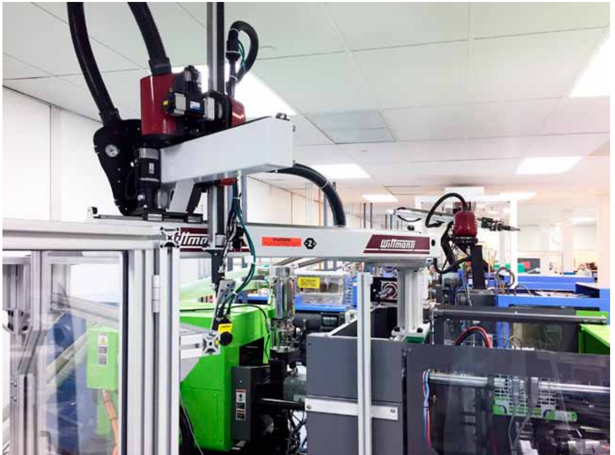
View of the RenyMed automation system: WITTMANN robots working on the RenyMed injection molding machines at their plant in Baldwin Park, California, USA.

R enyMed began in the mid-1980s as a one-man operation on borrowed equipment in rented space in California. Today they are one of the premier molders of medical products in the world, doing work for Fortune 100 medical device companies across the globe. In 2009 they moved to a new state-of-the-art facility in Baldwin Park, California, which is certified ISO 13485. They have over 50 employees working on 17 injection molding machines in a 20,000 square foot facility that includes a 4,000 square foot cleanroom. How did RenyMed go from a side project for Steve Raiken to an industry leader? According to Raiken, RenyMed President, “We have always been innovative. I think we are attracted to the jobs that other companies can’t or won’t do.”