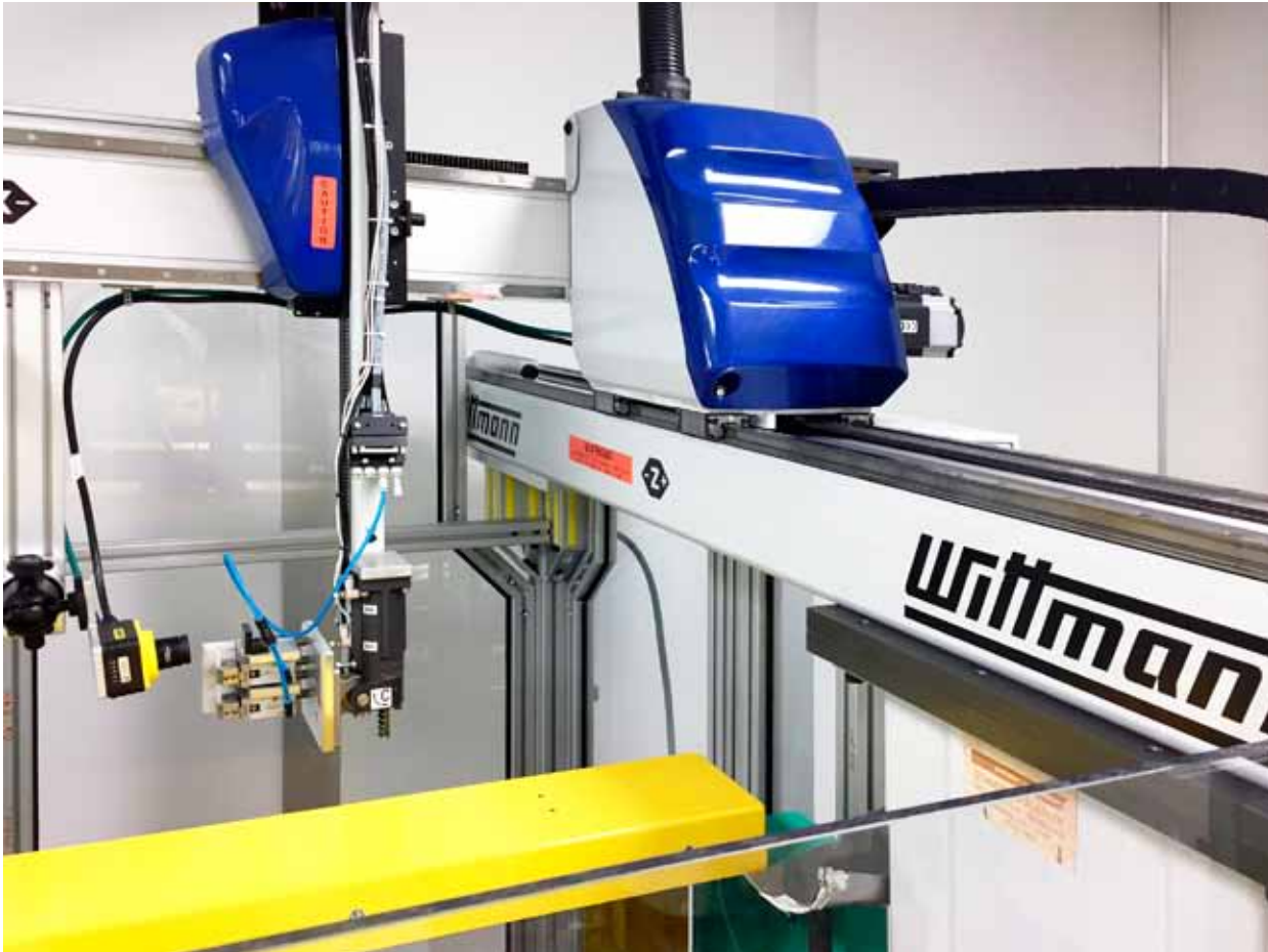
A view of the RenyMed inspection system.