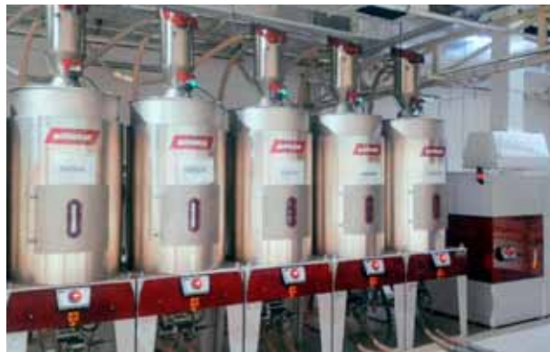
DRYMAX E1200 battery dryer with SILMAX drying hoppers.