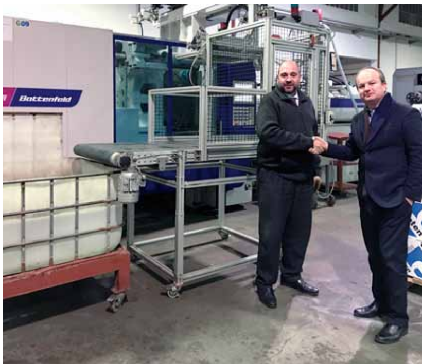
View of the HIDROTEN S.A. production plant in Alicante, Spain.

as an HM 180T/1330 machine from WITTMANN BATTENFELD have been successfully installed.