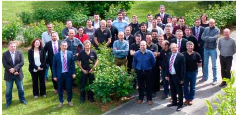
Part of the team of WITTMANN BATTENFELD France SAS, the French subsidiary of the WITTMANN Group.

This year, the MAS series was replaced by the new G-Max series. The G-Max 12 and G-Max 33 are the first granulators that are now equipped with a global electronic card allowing for real ease of use, energy saving, and exceptional efficiency. Soon, the range of screenless granulators will also be equipped with electronic cards.