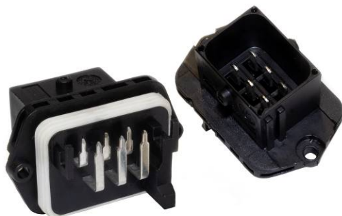
Fig. 4: Plug for the automotive industry