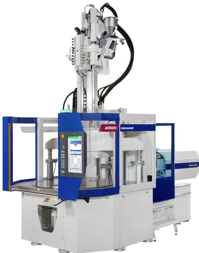
Fig. 1: VPower 120/130H/210V COMBIMOULD

At the K 2019, WITTMANN BATTENFELD will demonstrate the functionality of the VPower COMBIMOULD using a VPower 120/130H/210V . With this machine, a plug made of PA and TPE for the automotive industry will be manufactured with a 2+2-cavity mold. The complete automation system for the machine is designed by WITTMANN BATTENFELD Deutschland in Nuremberg. In this application, a Scara robot and a WX142 linear robot from WITTMANN are used, which insert the wrap pins, transfer the preforms, then remove and deposit the finished parts.